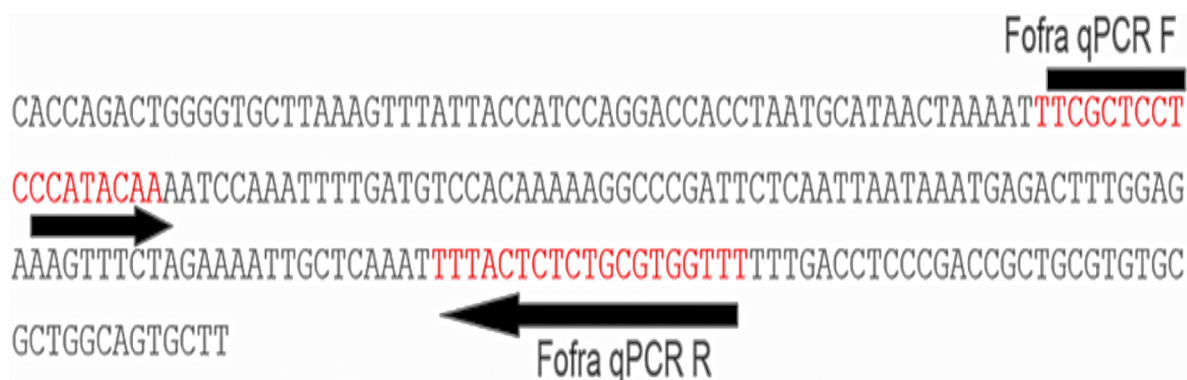
Supplementary Fig. 1. Positions of Fofra qF and Fofra qR primers in inter-retrotransposon region of Fusarium oxysporum f sp. fragariae . Red color characters indicate the positions of the Fofra qF and Fofra qR primers and black bar and arrow were each primer's direction.