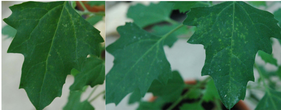
Fig. 1. Necrotic local lesion symptoms on Chenopodium quinoa leaves inoculated with sap from beet soil-borne virus (BSBV)-TR1 infected plants.

significance levels set at P = 0.1 . Recombination analysis was conducted using different algorithms implemented in the RDP4 v.4.16 (Martin et al., 2015).